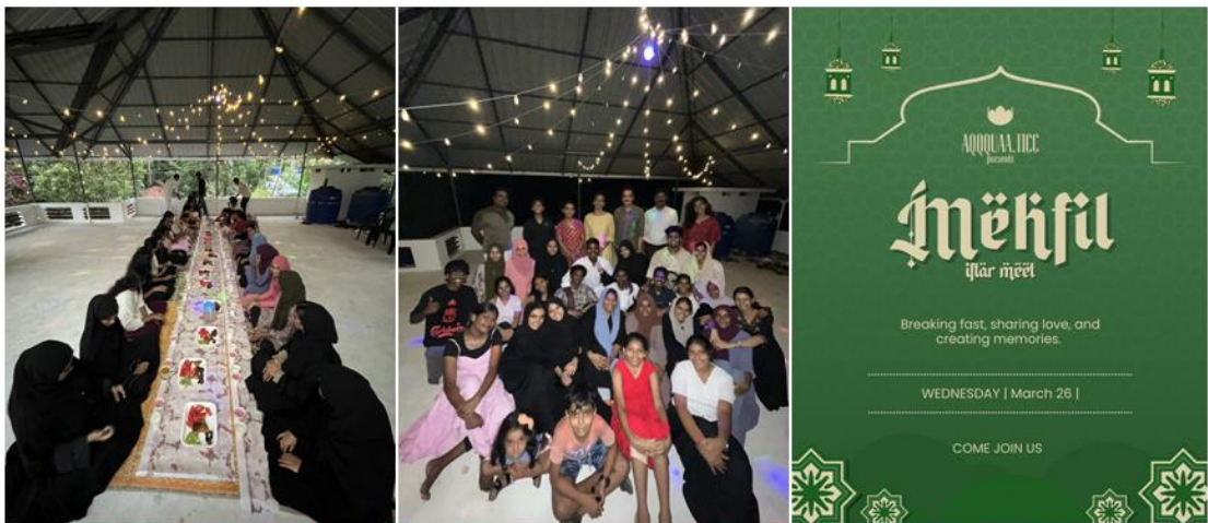
IFHAR MEET ORGANISED BY II YEAR B.Sc. AQUACULTURE STUDENTS ON 26/3/2025 AT AZHIKODE, KODUNGALLUR

Activate Windows Go to Settings to activate Windows.