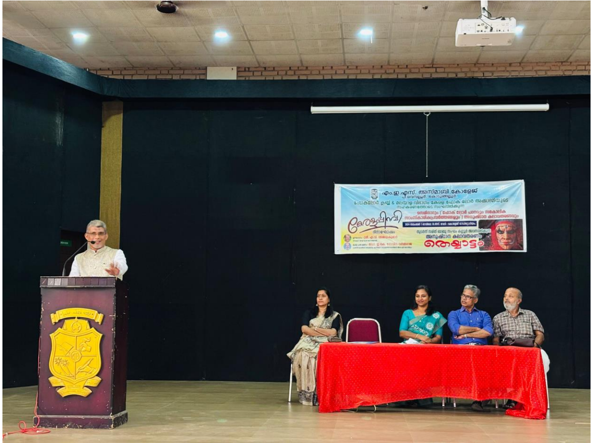
Department of Malayalam and Folk Lore Club 01-11-2024