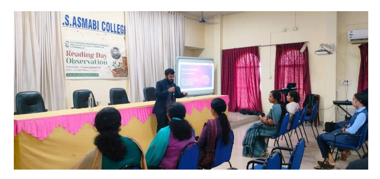
A book exhibition was also organised in the department as part of reading day.