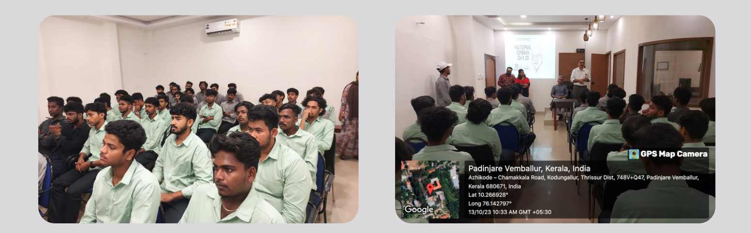
The film screening took place at the Media Lab, where 54 students gathered to watch 'Irakal,' a film directed by KG George. The choice of 'Irakal' was a fitting homage to the renowned director and added a cultural and educational dimension to the event.