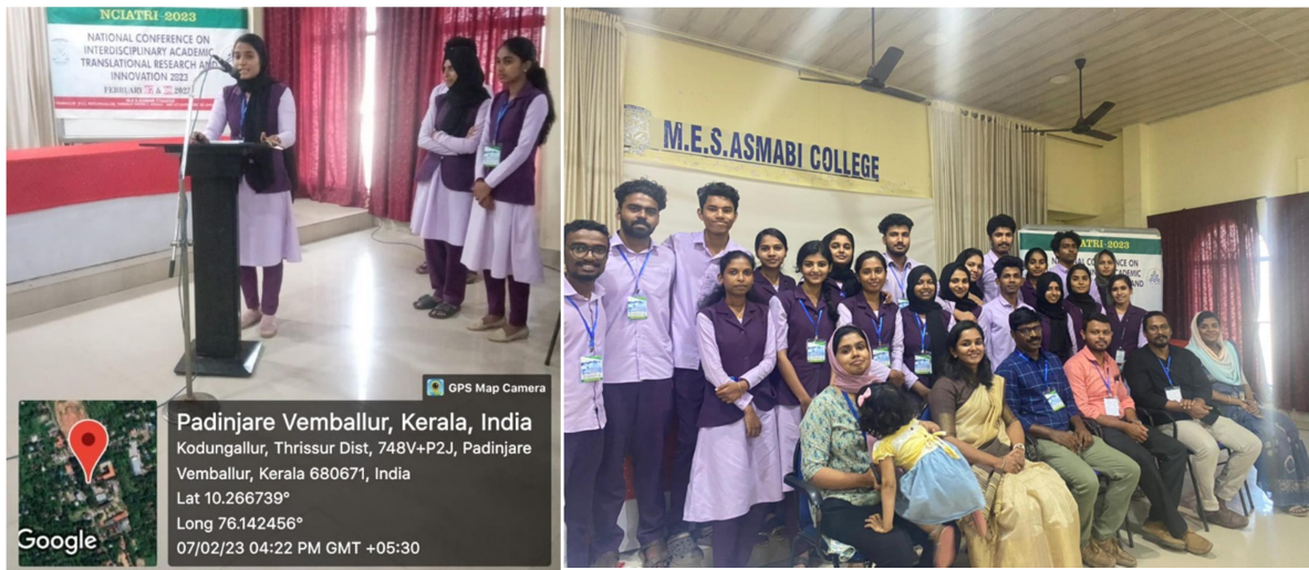
Participants and presenters of the of the parallel Session 4 at Seminar Hall