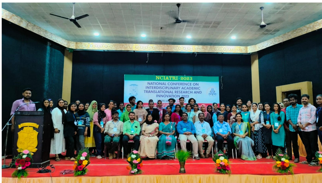
Organizers, presenters and participants at the Valedictory session at Auditorium