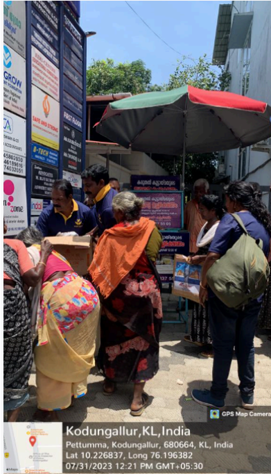
Kodungallur, KL, India Pettumma, Kodungallur, 680664, KL, India Lat 10.226537, Long 76.196382 07/31/2023 12:21 PM GMT+05:30