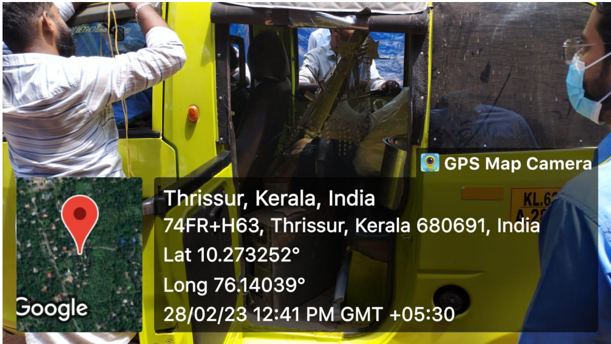
Despatching of E- Waste to College