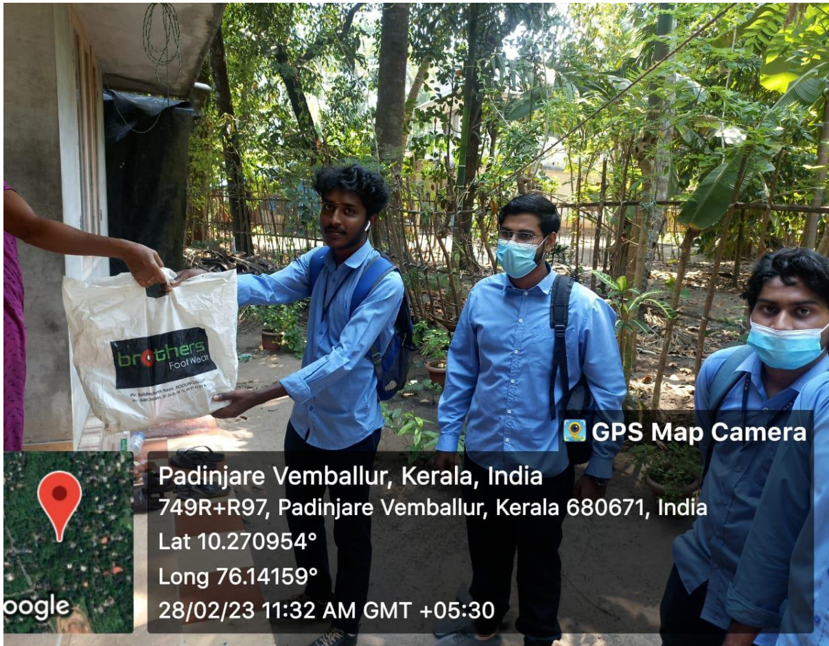
Collection on 28/02/23