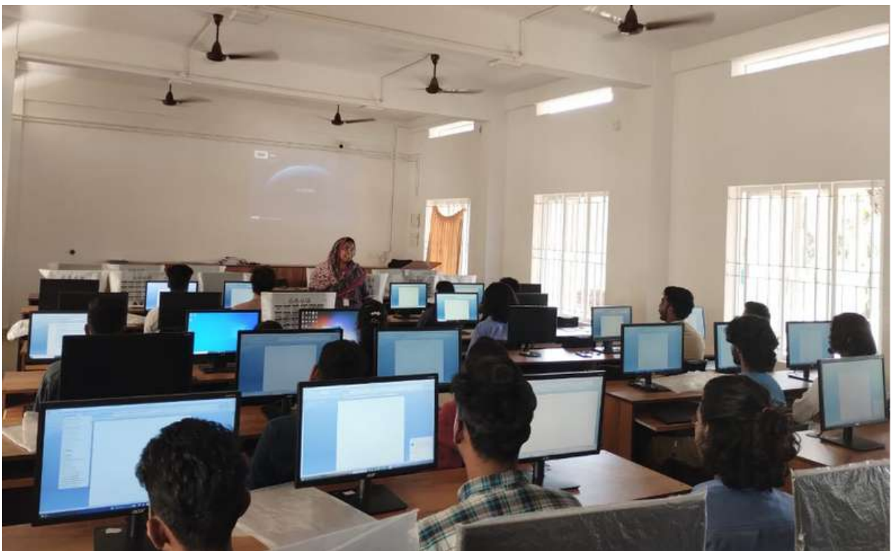
Photos of the session