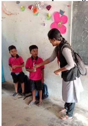
Valedictory Session at MIT UP School, Anjangadi