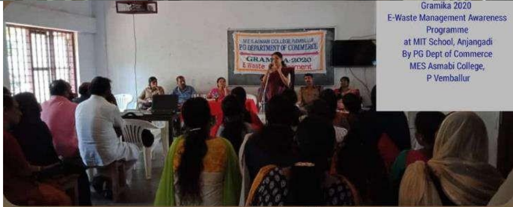
Gramika 2020 E-Waste Management Awareness Programme at MIT School, Anjangadi By PG Dept of Commerce MES Asmabi College, P Vemballur