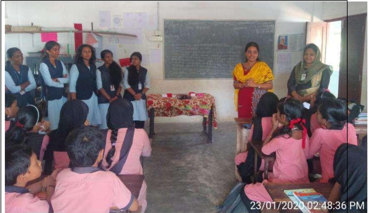
Distribution of paper pen and 3 in 1 mobile purse as green practices.