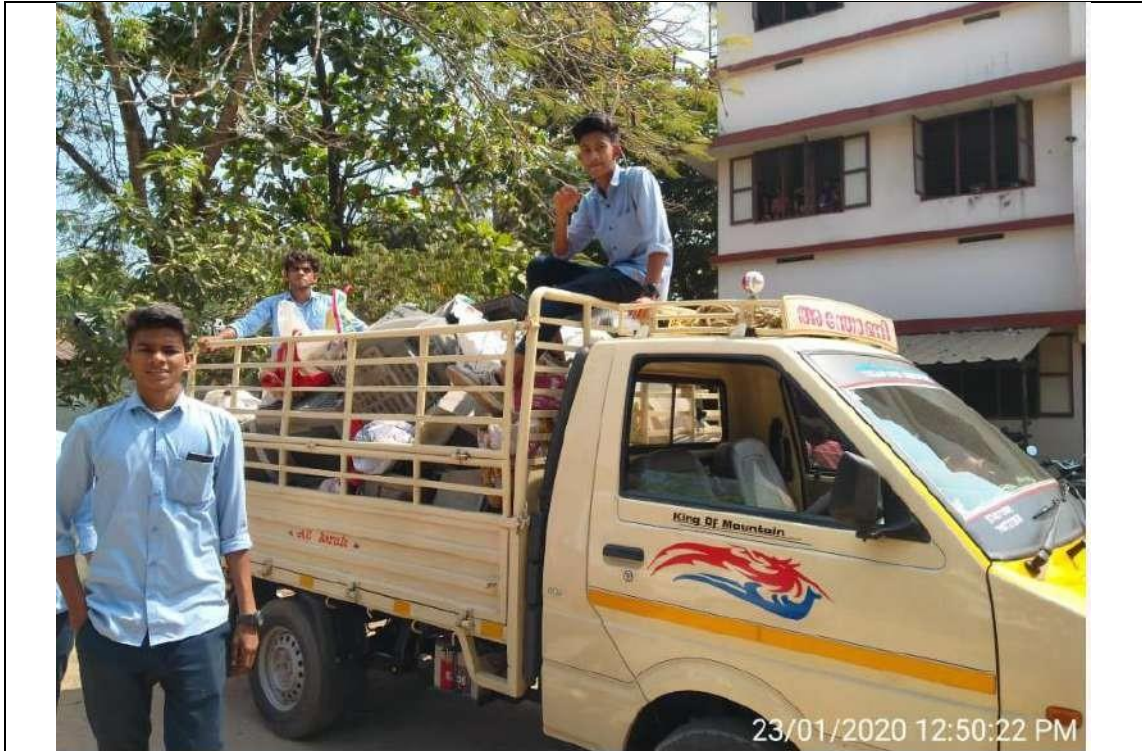
Awareness class on waste disposal for sustainable environment with games and refreshments to students of MIT UP School.