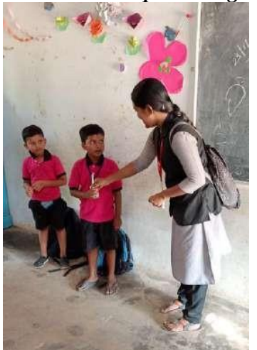
Valedictory Session at MIT UP School, Anjangadi