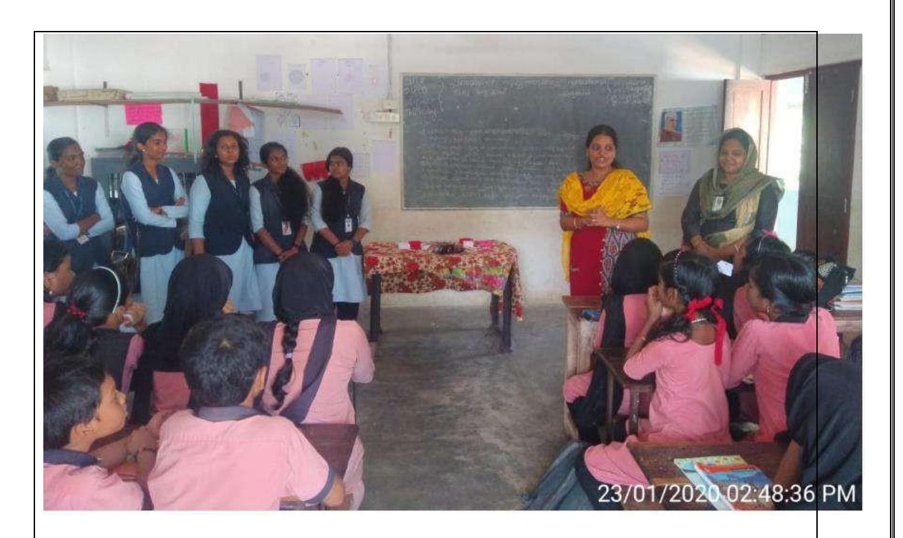
Distribution of paper pen and 3 in 1 mobile purse as green practices.