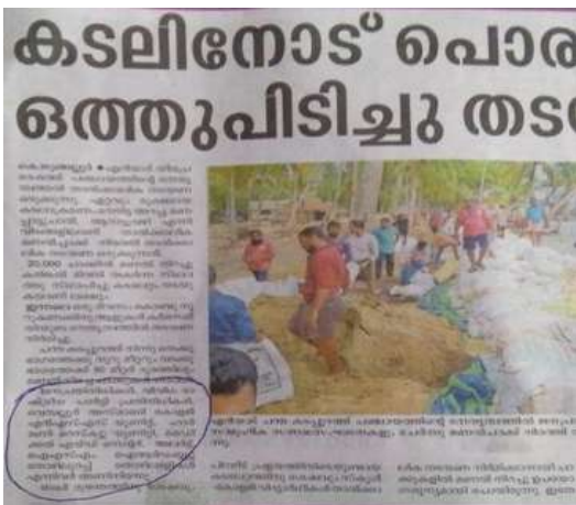
STUDENTS MAKING SEA WALL SACK OF SAND