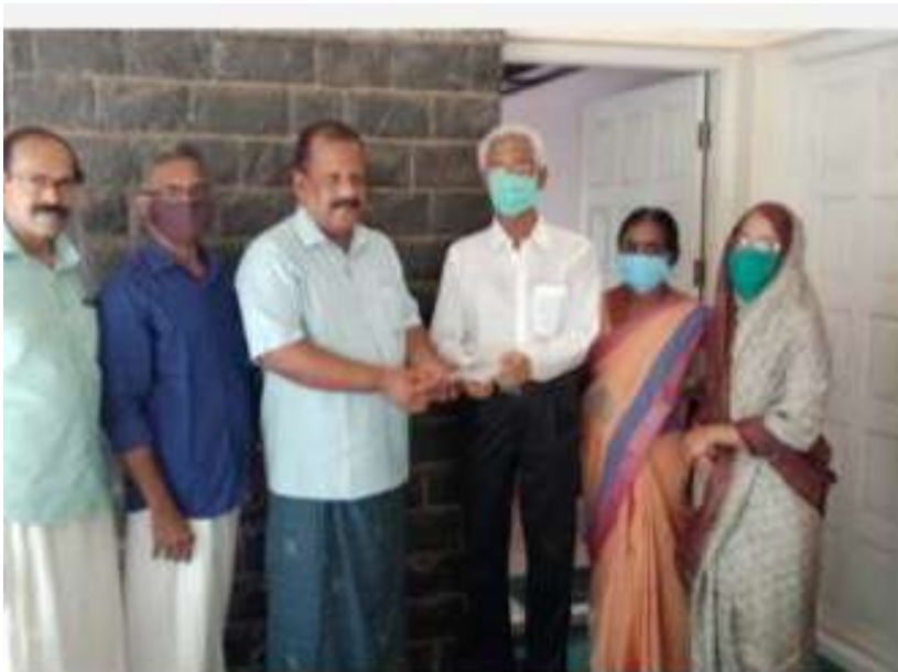
Alumni contribution towards chief minister's relief fund handing over to Local MLA

The Contribution to Chief Minister's Relief Fund program organized by the Alumni Association aimed to demonstrate collective support and solidarity with the community during times of crisis. Through financial contributions to the Chief Minister's Relief Fund, the alumni community sought to play an active role in addressing urgent needs and providing relief to those affected by various challenges. Contribution to Chief Minister's Relief Fund through Alumni program represents a collaborative effort to address immediate and critical needs within the community. Through this initiative, the Alumni Association aimed to leverage the collective strength of the alumni community in providing timely and substantial support to the Chief Minister's Relief Fund, contributing to the overall resilience and well-being of the community during times of adversity. Run a public awareness campaign within the alumni network and beyond, educating individuals about the importance of contributing to the Chief Minister's Relief Fund and the positive impact of collective donations.