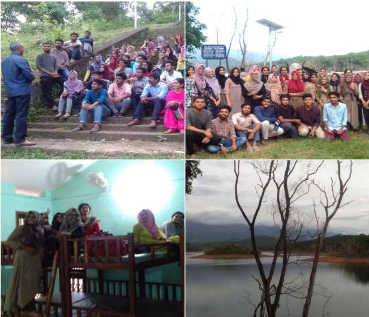
Nature Camp At Pepara Wild life Sanctuary

Three day nature education camp at Pepara wildlife sanctuary (Trivandrum) for NSS volunteers of the college organized by Kerala Forest department during 16th to 18th July 2019. The volunteers could enjoy the experience of trekking in the thick forest area and the natural Vazahuvanthole waterfalls. The team was accompanied by POs Dr.Sheeba.N.H. and Mohammed Areej.E.M. Food and accommodation were provided by the forest department on these days in their guest house at Pepara.